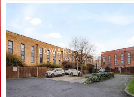
EDWARD CHASE WATERSIDE CLOSE IG11 Approximate Gross Internal Area 2750 sq ft / 304.06 sqm